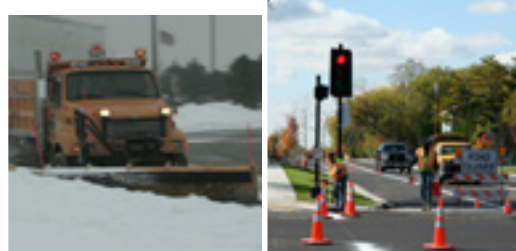
20% will be invested in public works services, such as snow plowing, road maintenance and similar work