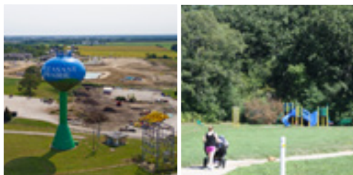
5% will be used for the Community Development Department and the Village parks system