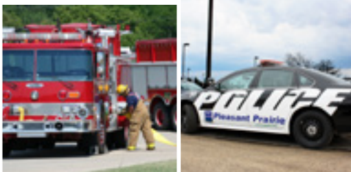
48% will be invested in public safety services, including police, fire and rescue

The majority of 2019 budget dollars (approximately 68%) will be used to provide public safety services, such as police, fire and rescue, and public works services, such as snow plowing, road maintenance, and similar work. The remaining amount (roughly 32%) will be used to: pay down existing debt, finance General Government's day-to-day operations, operate a Community Development Department, and maintain the Village parks. Percentages* for each area are shown below.